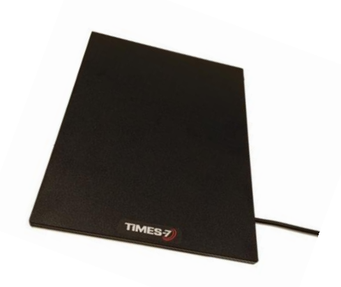
The SlimLine B6031